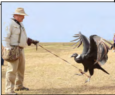
More fun at the Wildlife Expo! Plan to come next year!