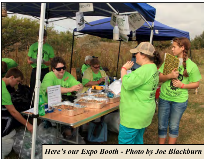
Here's our Expo Booth

The leftover seed will be used to fill the feeders around the Anahuac NWR Visitor Center this winter.