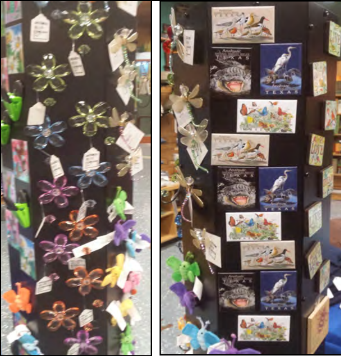
Magnets - birds, butterflies, gators, note clips, stars, etc.