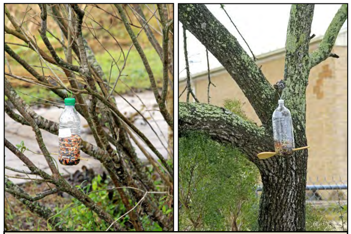
Here are a couple of the finished feeders